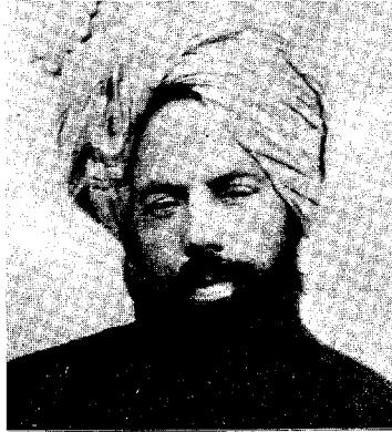
HAZRAT MIRZA GHULAM AHMAD (THE PROMISED MESSIAH)