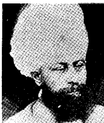
KHALIFATUL MASIH II

declared Mecca to be the place of Pilgrimage. So, this Eid does not commemorate Abraham's preparedness to slaughter Ismael with the knife, but it commemorates his virtually slaughtering him by leaving him in the barren and desolate valley of Mecca. Leaving a child of eight at such a place was really slaughtering him.