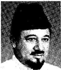
MIRZA MUBARAK AHMAD

(Lecture delivered in Indonesia in 1969)